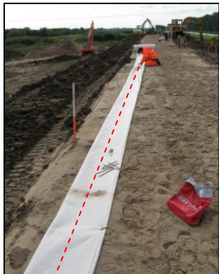
Fiber optic cable